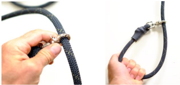
Figure 1.4 Adjusting the position of the snap clip.

The snap clip on the Rescue Tek is specifically sized to grip the leash. This means you can grab the leash at any point. Use the clip to create a handle sized for your hand or use it to lock the slip lead against the animals' neck for extra security (figure 1.3). A longer handle also means a shorter leash for those times when greater control of the animal is needed. With the clip fixed to the leash, grab the snap clip to adjust or grab the end of the handle to keep the clip locked (see Figures 1.4 and 1.5).